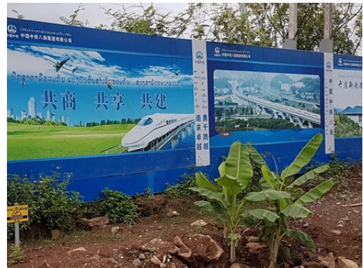
The New Silk Road in Laos

And lastly, China’s policy is an effort to supplant the established world order dominated by the Bretton Woods Institutions . China sees the Asian Infrastructure Investment Bank as a financial instrument capable of freeing the region from the clutches of the US-centric international system. The country’s decision to create a domestic oil futures trading market – denominated in yuan and convertible into gold – on the Shanghai and Hong Kong stock exchanges is a clear step in this direction. Because China has a trade surplus and vast currency reserves , it has the financial clout to fund the New Silk Road programme and to shape it in whatever way it sees fit.