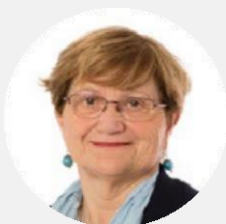
Laurence Harribey Co-rapporteur Socialist, Ecologist and Republican Gironde